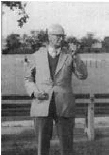
A familiar face at the shot put