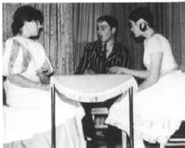
The Gibbs family at breakfast