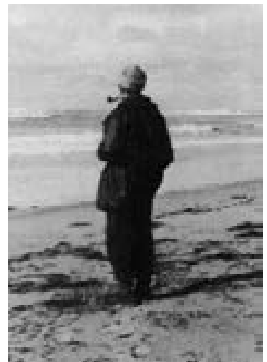
No Sir ! It's too far to swim