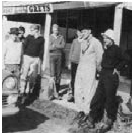
The May Hike