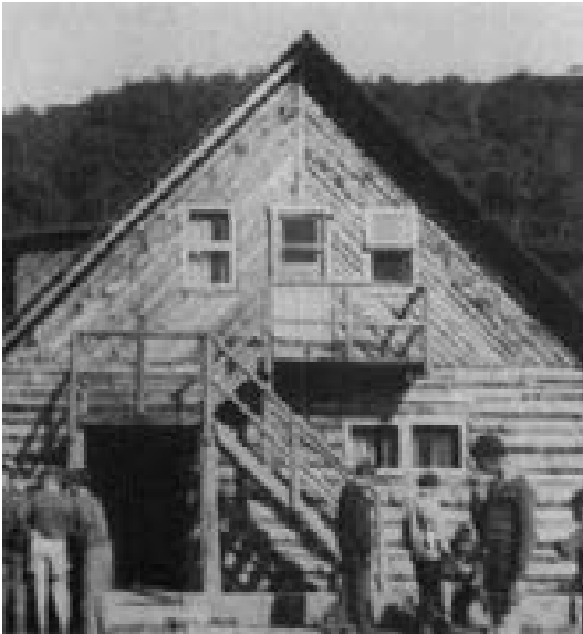
The Prep. Camp at Harrietville