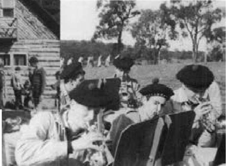
Some work, some play