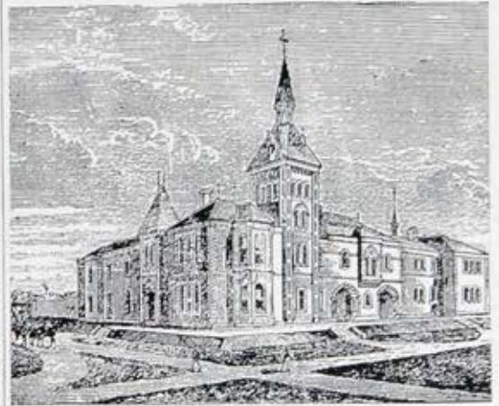
THE COLLEGE according to the Original Architect's drawing. This etching first appeared in the 1911 edition of the "History, Register, and Records" of Geelong College.