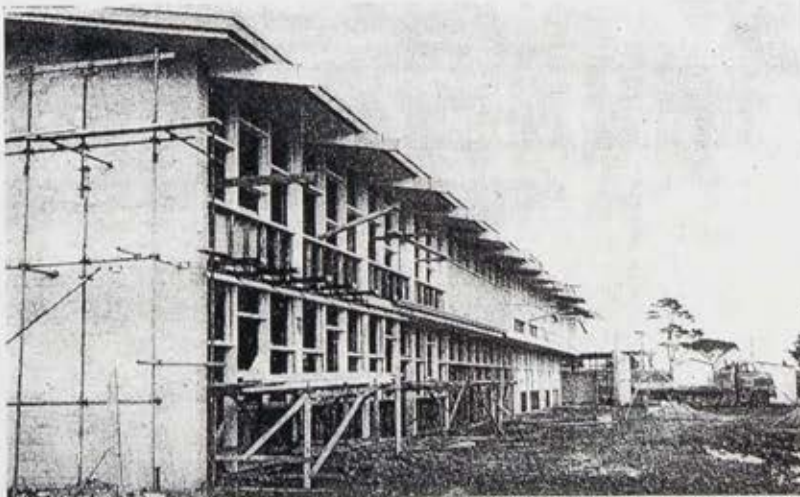
Recent view of the New Preparatory School