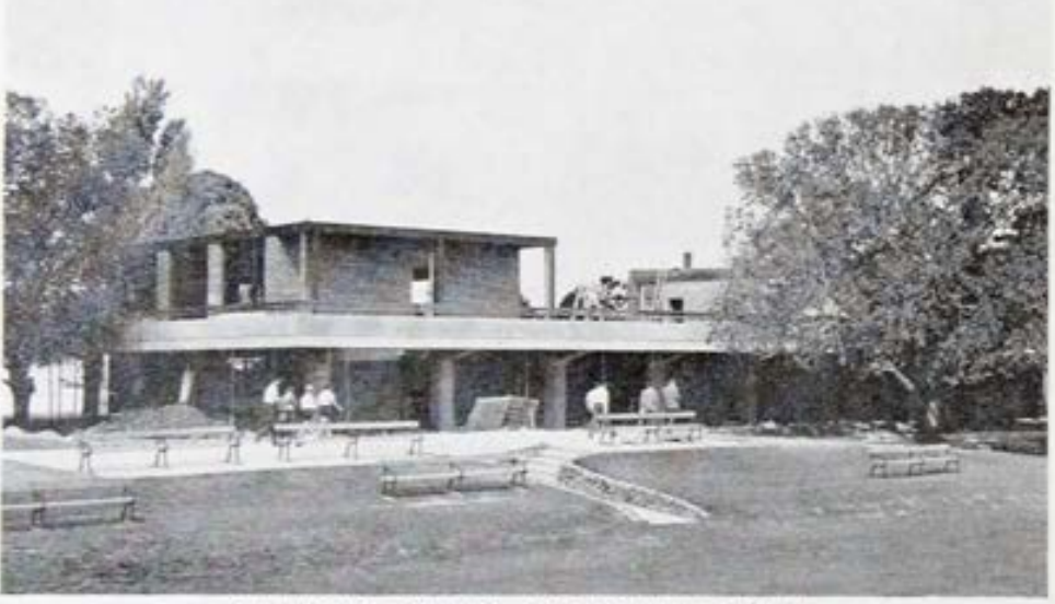
CHANGING SKYLINE: THE ROLLAND CENTRE

However, the dressing rooms in the Rolland Centre, the space under the new Morrison Court and the remodelled ground floor section of the Morrison Hall (about to be undertaken) will soon give the College the largest and best accommodation of this kind that it has ever had.