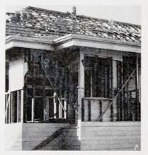
First stages of demolition