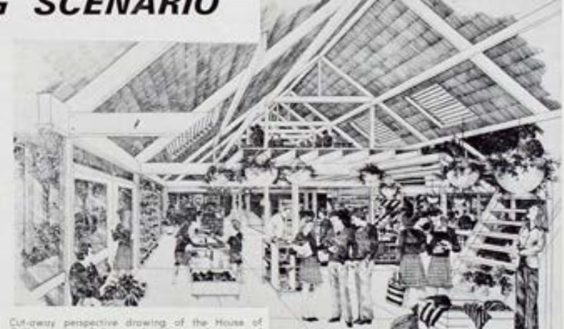
Cut-owary perspective drawing of the House of Guilds section of the new building, to be situated on the western side of the existing courtyard.

Subsequently, a new building, to be known as the House of Guilds and to re-