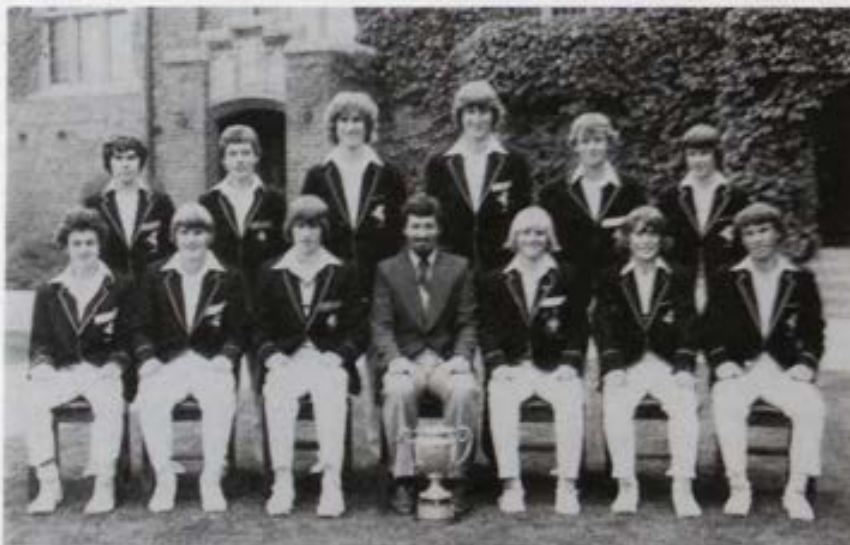
The Geelong College A.P.S. Premiershhip Team — 1979