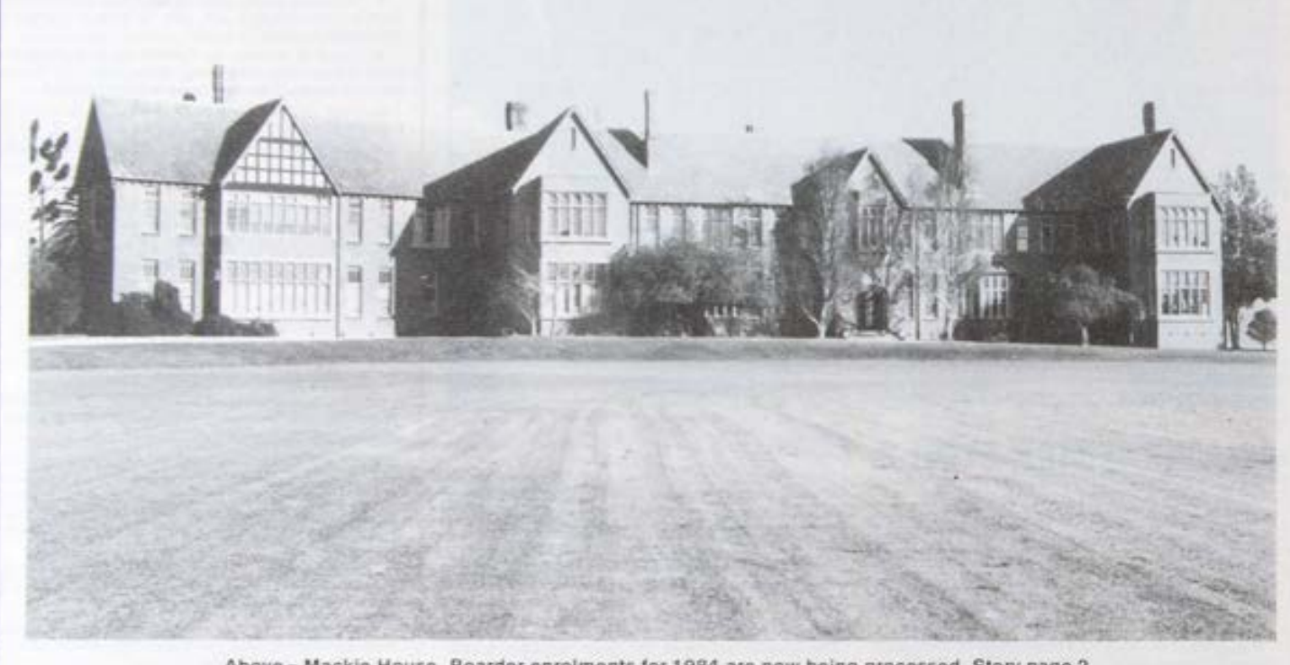
Above - Mackie House. Boarder enrolments for 1984 are now being processed. Story page 2.