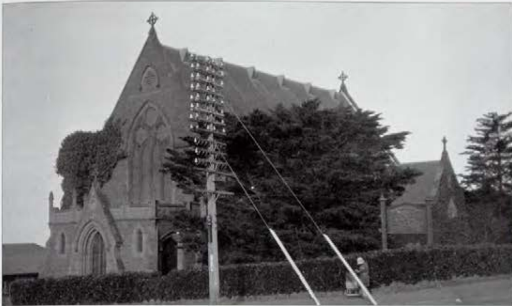
St George's Church, c1930. The College had an association with the church for one hundred years.