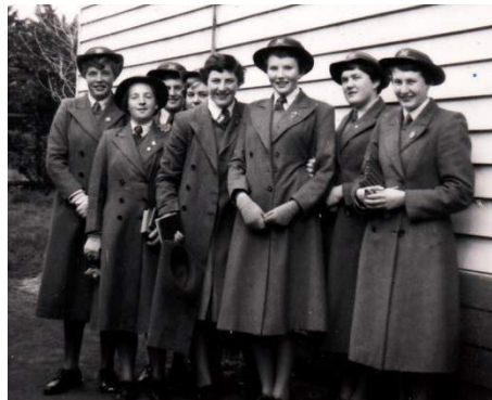
1 'The Codfish Family' Nickname for the group of boarders 1954...Boarders waiting to go to Church

May we all continue to enjoy the friendships made during our years at Morongo and be reminded how fortunate we were to have had the opportunity to attend such a wonderful school.