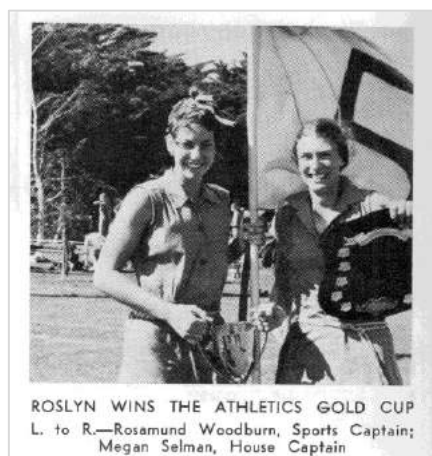
Shannon Cup – from the Lucernian 1973