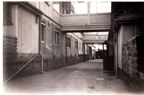
The Cart way between Dudley and the servery 1953