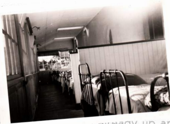
Beds on the BALCONY 1954

ne mor ng. I y oked at ck. "T d bette sed quick aring en. "Oh dear!" she said "Not gh m shop t whe ill you s, Mu s cold