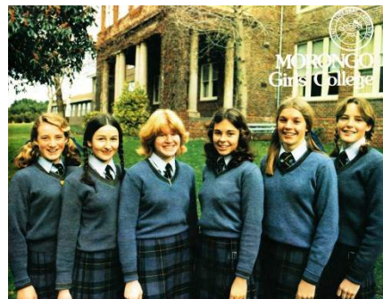
Cover of Morongo Brochure, c 1978