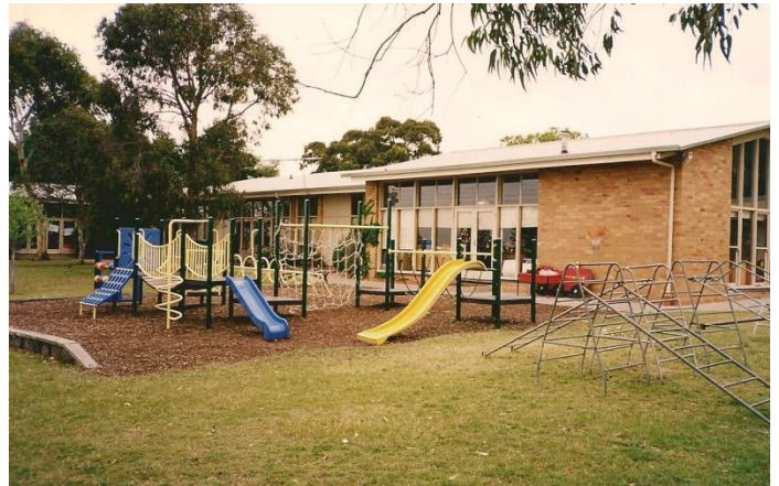
Junior School