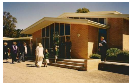
From the Morongo collection