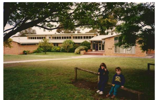
From the Morongo Collection Far L: Photo caption: "Who said Morongo food was fattening" Lucernian Vol. 4 No. 2 1976 p56