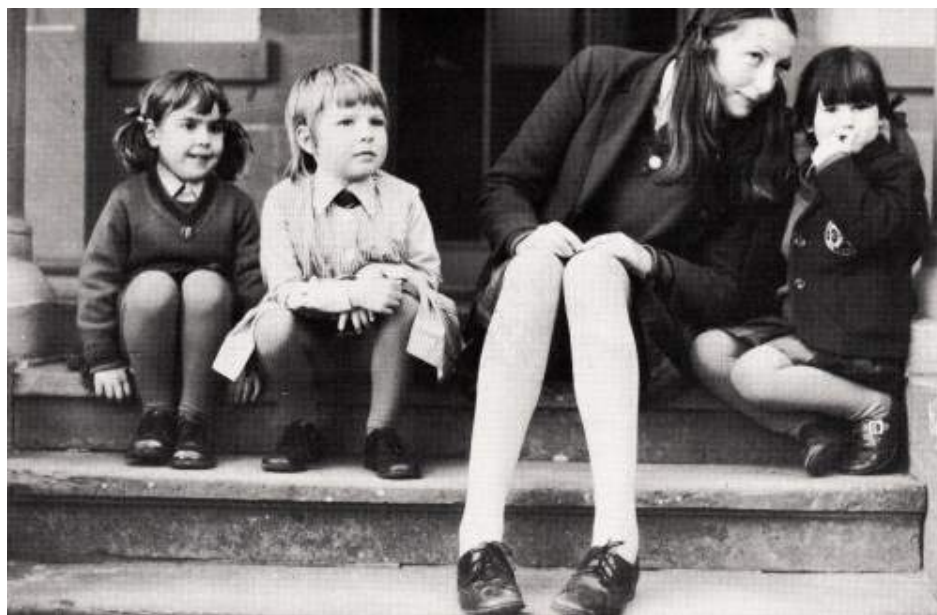
"When I was in Junior School....."