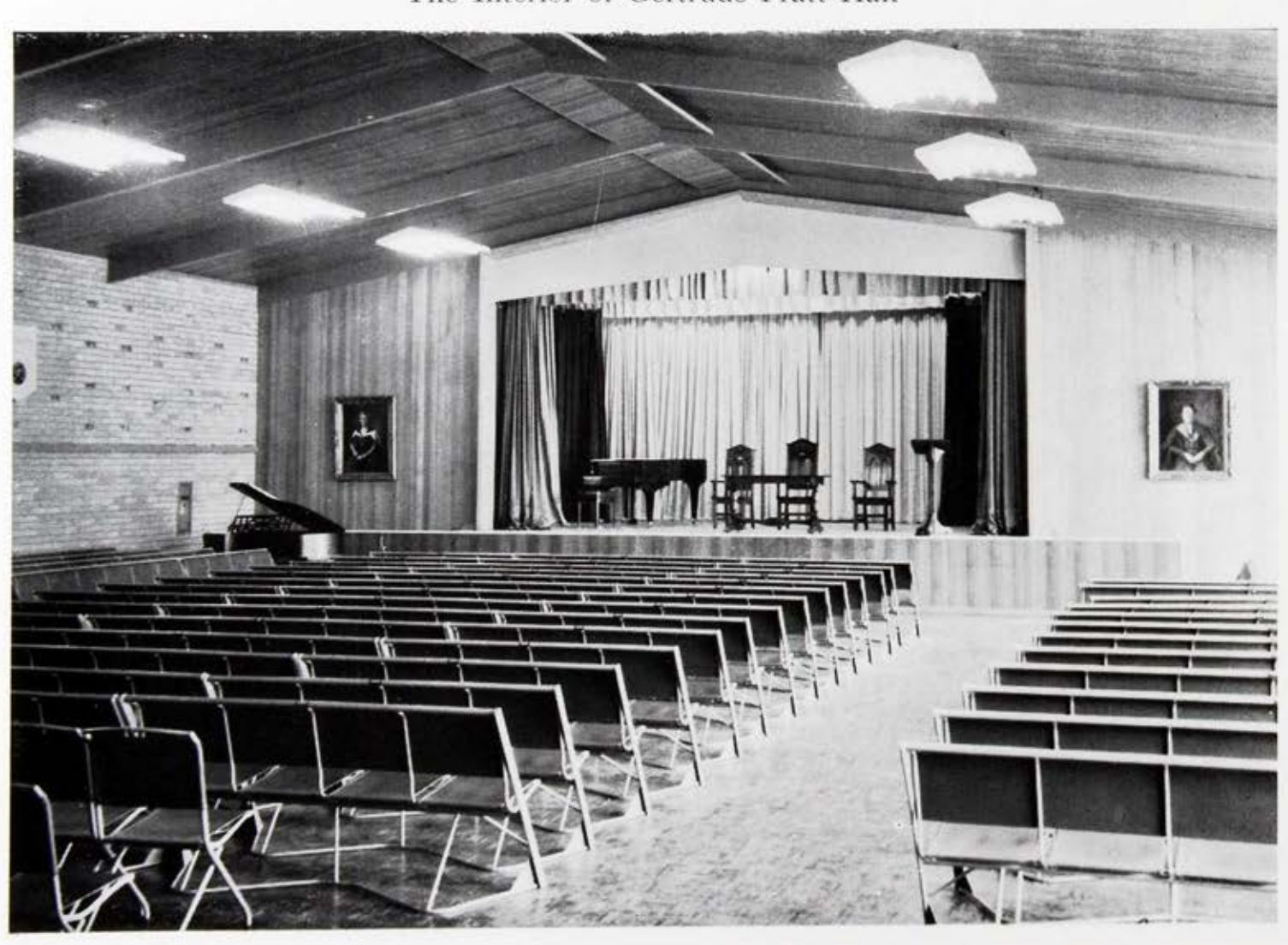
The Interior of Gertrude Pratt Hall