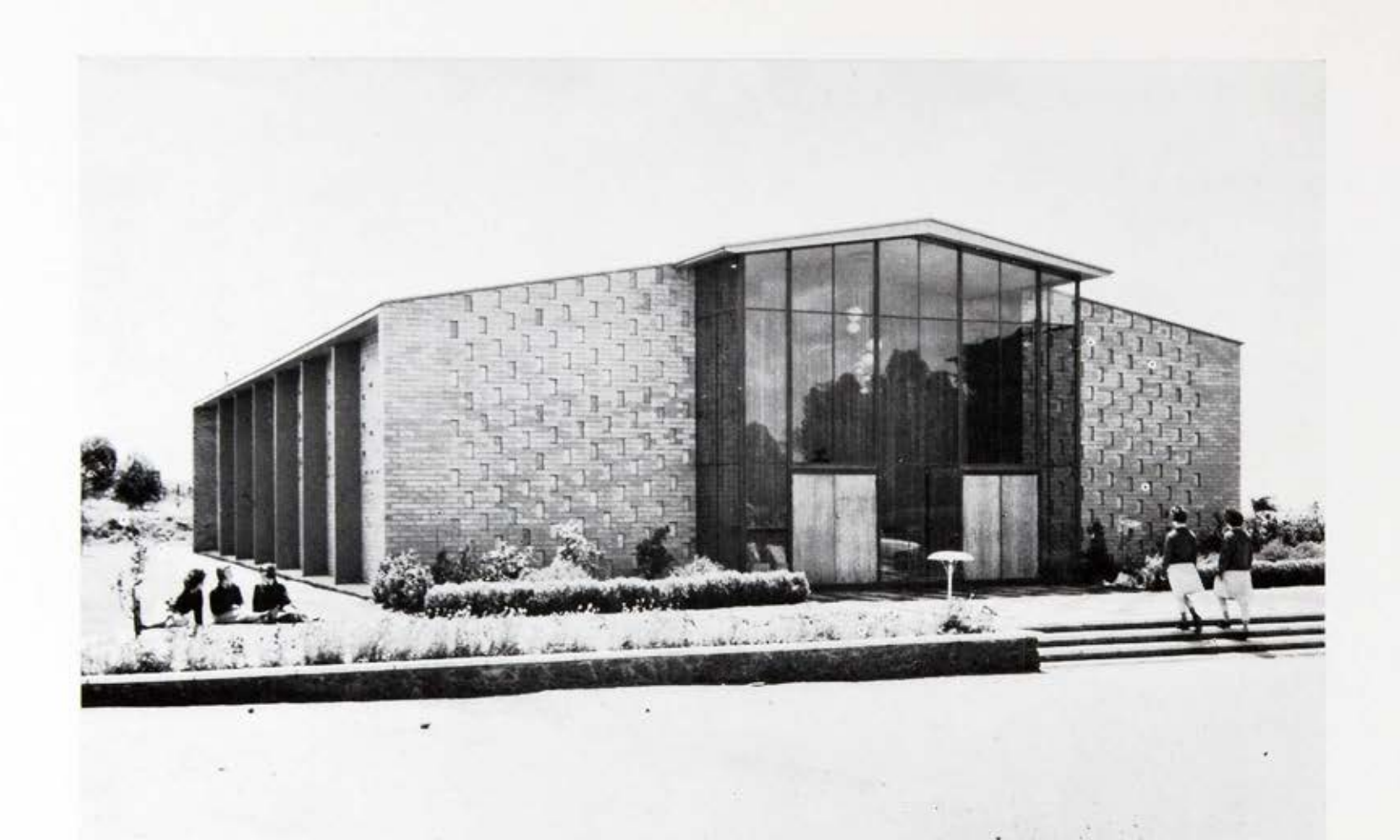
The Gertrude Pratt Hall—1959