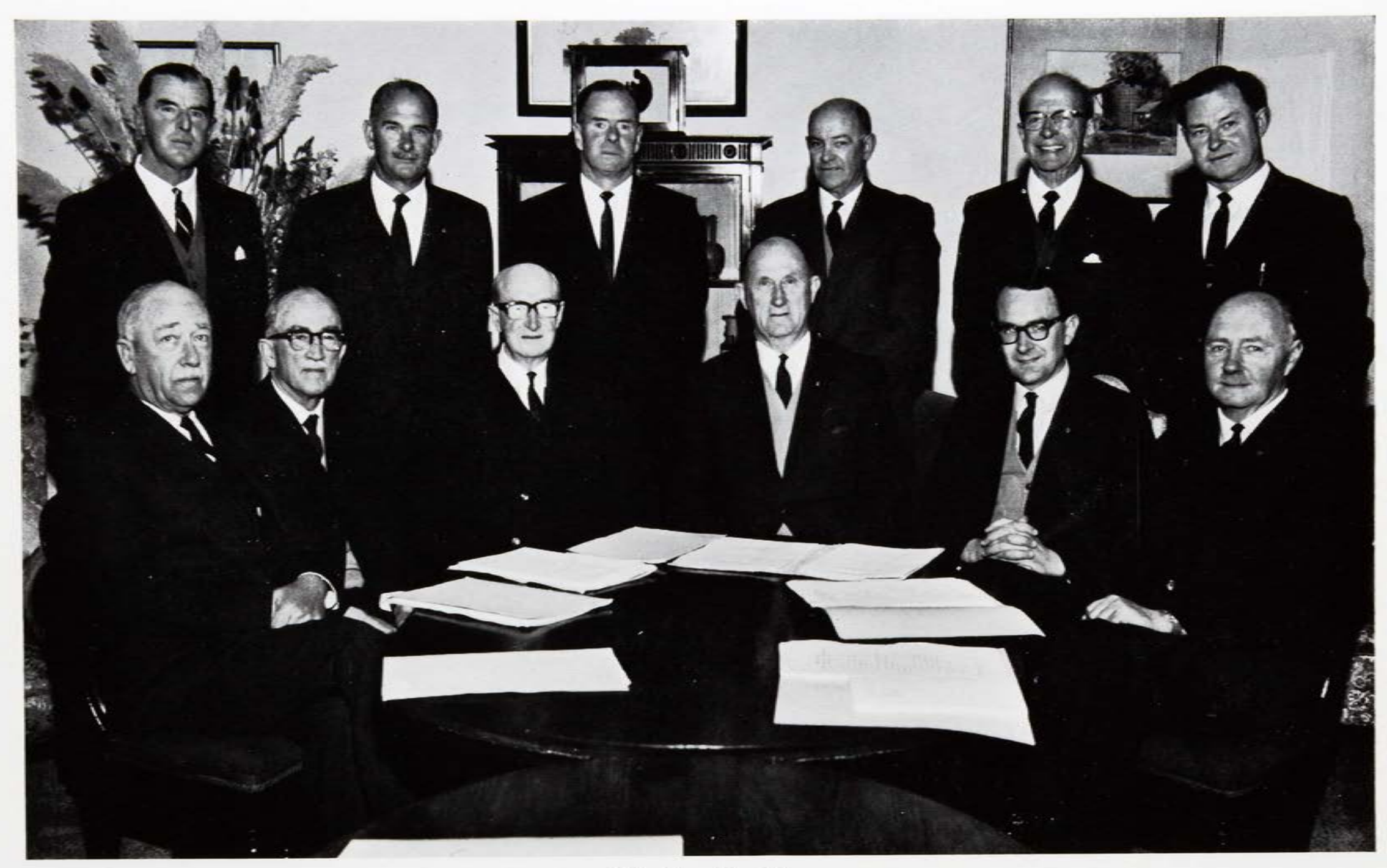
The Council 1968