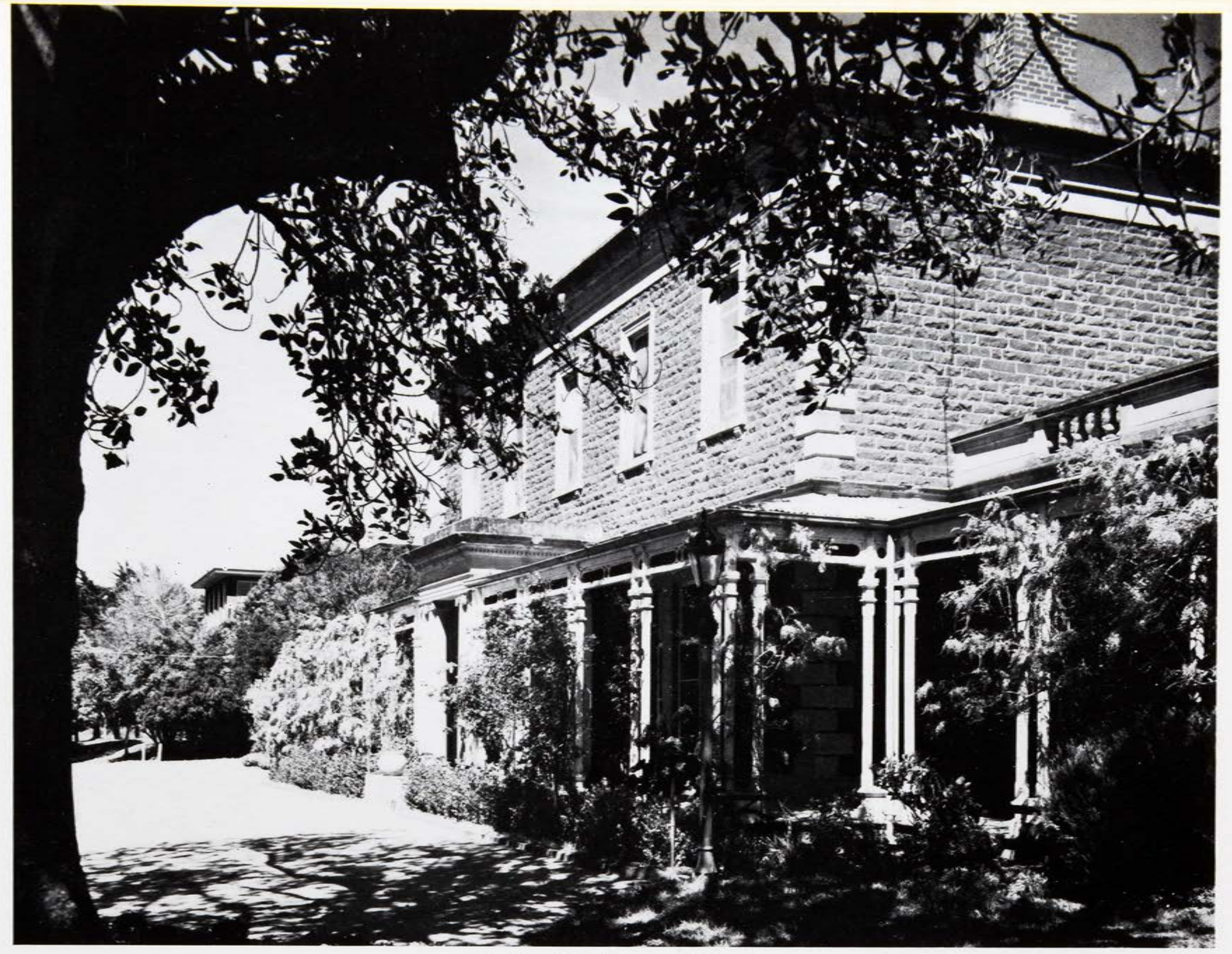
The Boarding House and School