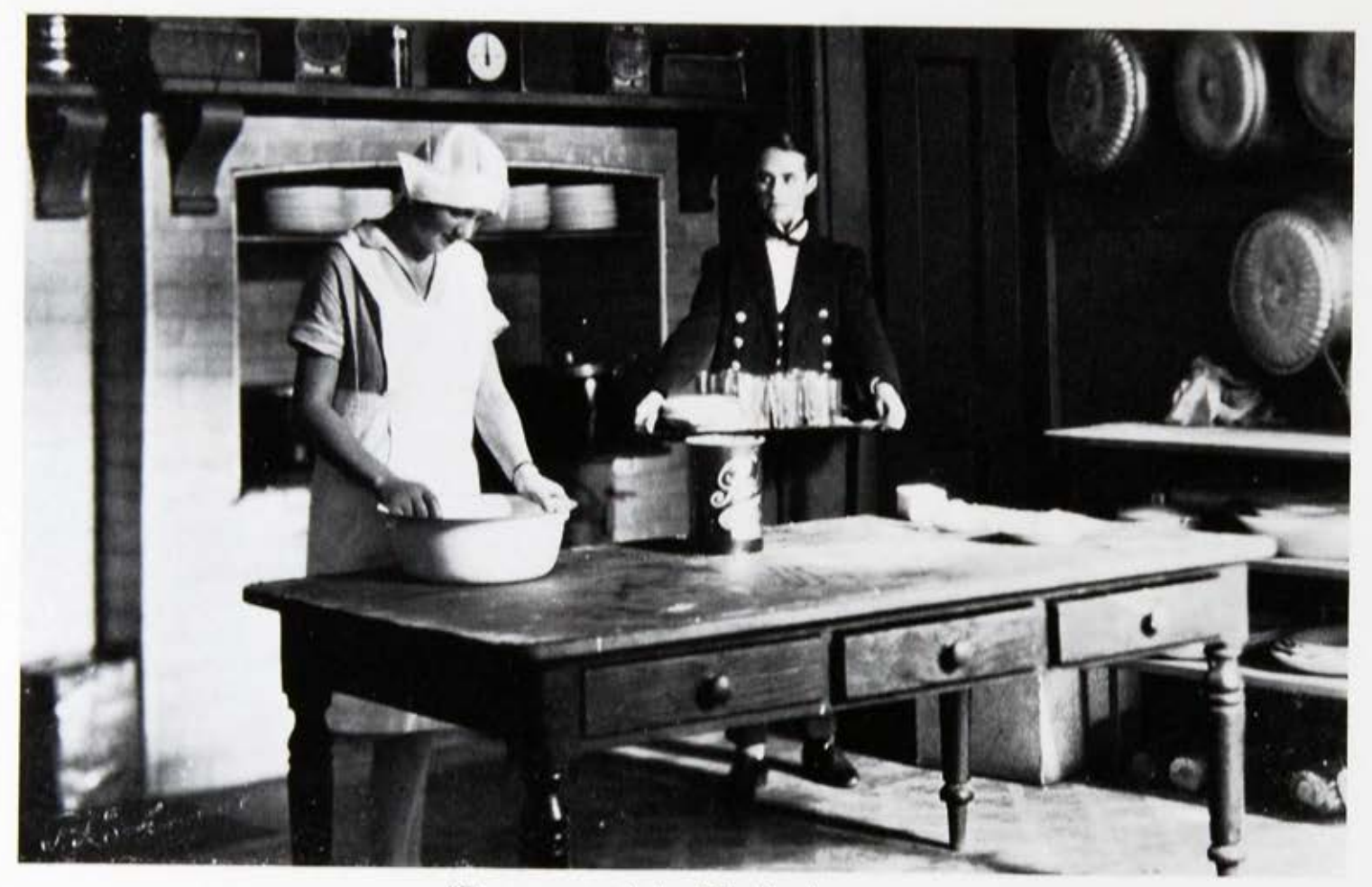
'Come out of the Kitchen'-1927