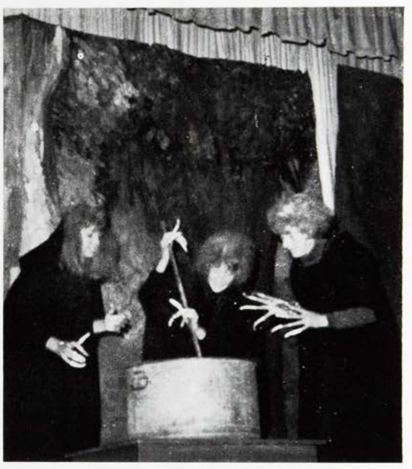
The Three Witches