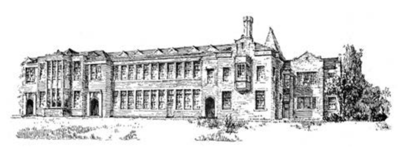
JUNIOR HOUSE IN COURSE OF ERECTION.