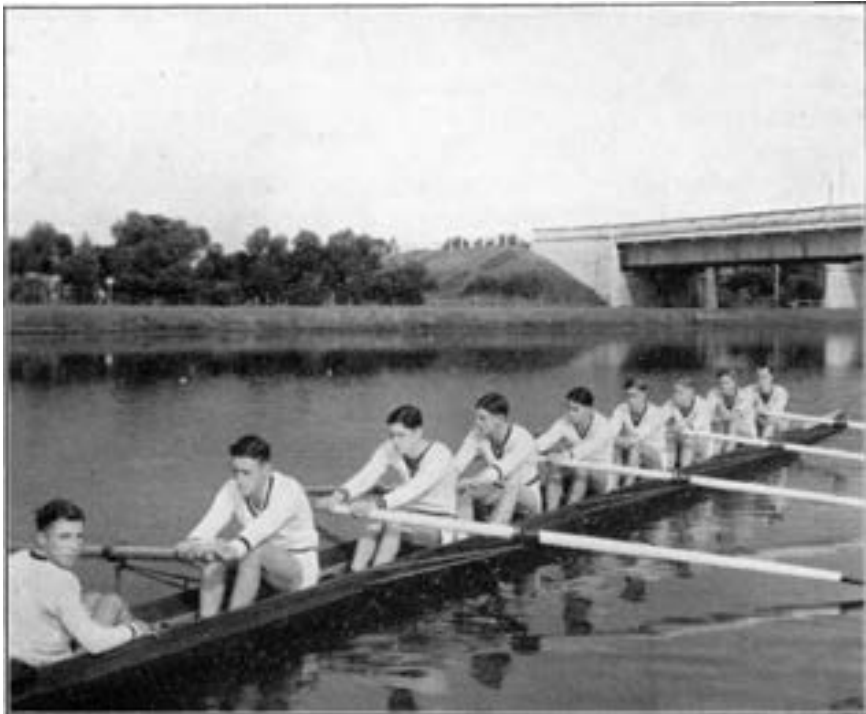
THE EIGHT, 1938.

About the middle of May, victims of this black magic rush yelling about the river bank. Some know why, but they bemoan the rain and the elbows and their tender corns. Pretty girls don Hollywood hats from the property chest of "The Good Earth" or "The Seven Dwarfs" and fly yards of ribbon to match their new frocks. The umpire has a fairly good view of the twenty-one minutes' actual