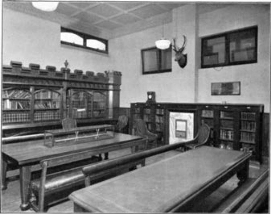
A Corner of the Morrison Memorial Library.

Association ties are on sale by Bright and Hitchcocks, Pty. Ltd., Geelong, price 4/6 each. Orders must be obtained at the office of the Association, 4 James Street.