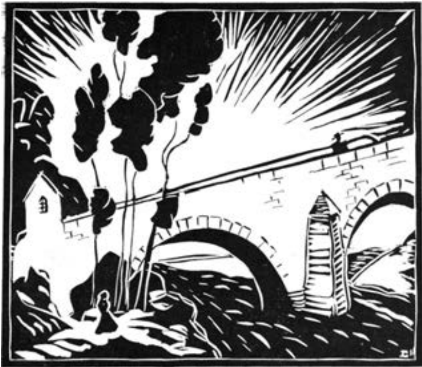
A Lino Cut executed by a member of the House of Guilds.