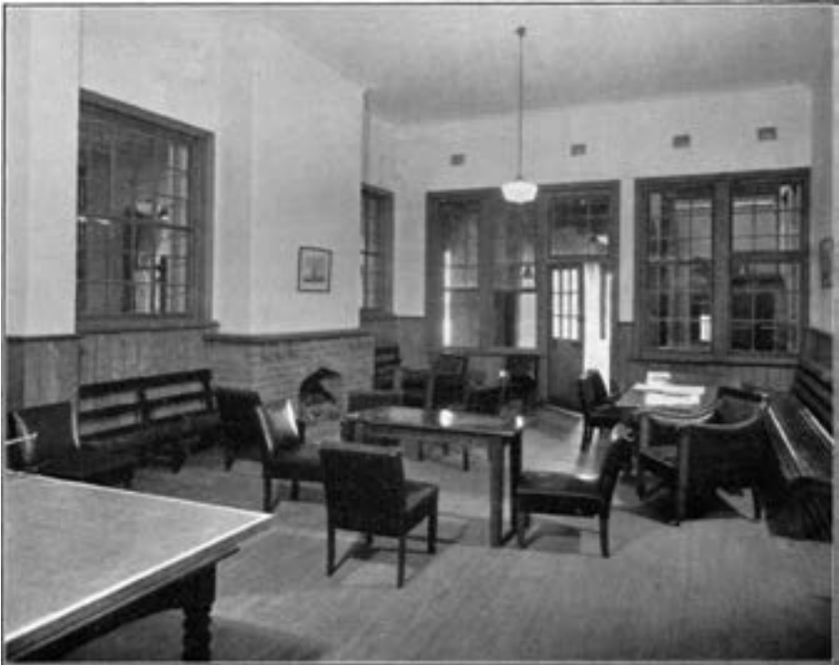
The New Senior Boarders' Sitting Room.

The Church is carrying on a great work and calls to those of you who are Presbyterians, when you leave school, to enter into the activities of one of her congregations and do your part in ensuring that she will accomplish even greater things in this new century of her history.