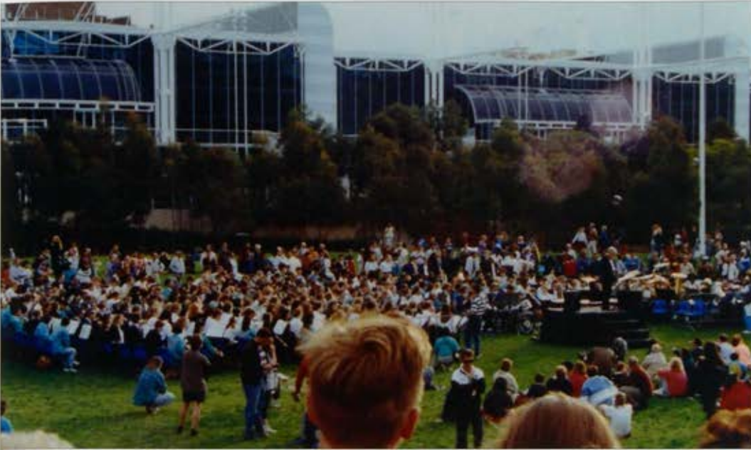
At the Sydney International Music Festival in 1992 with the massed band of 500 performing