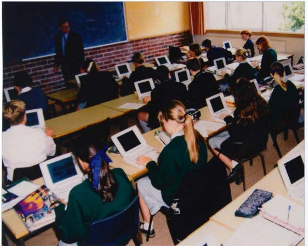
Above: Wollangarra, 1999