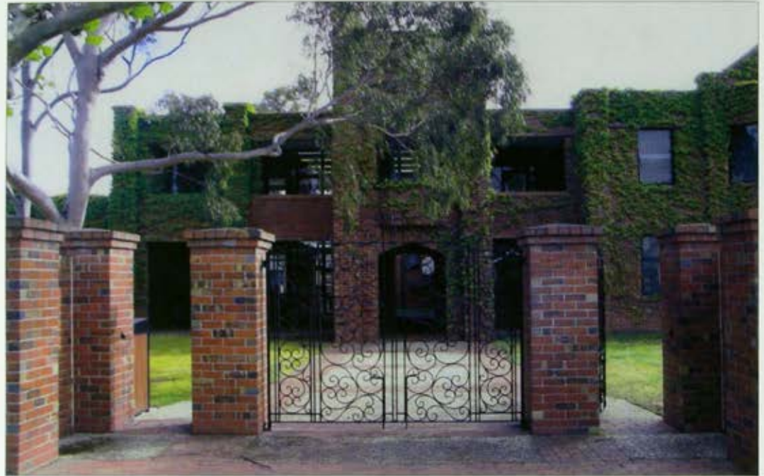
Noble Street classroom block

Not only was The Geelong College Foundation an important step in the renewed engagement of the school community, and a recognition of the need to communicate clearly the College's visions and plans for the school, but it became 'a fine bulwark against financial difficulty'.