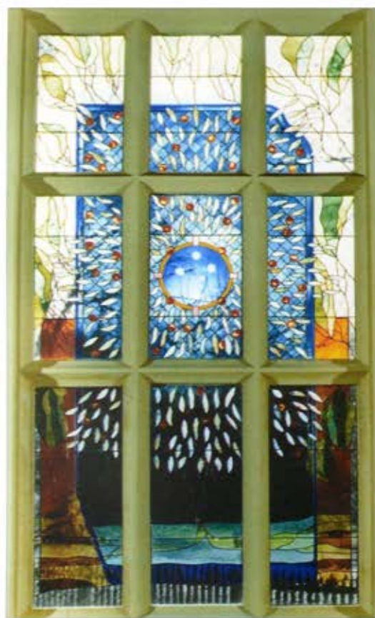
Above: Chapel interior, 2009