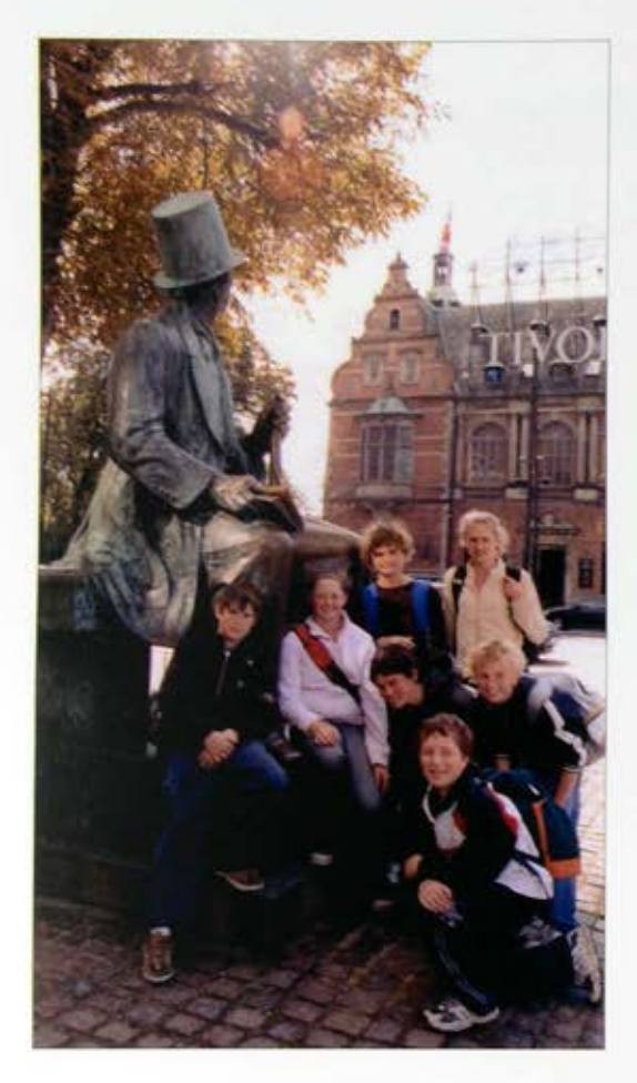
Students on tour in Denmark, 2004

Recent College graduates respected the way Uniting Church doctrine was not forced upon them, and appreciated the emphasis, instead, on the treatment of others according to Christian principles.