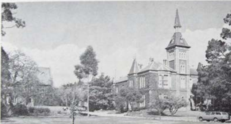
Almost the same view today — 1976