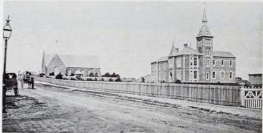
A view of the original College building — 1871