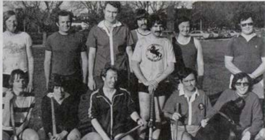
Above; The 1967 Team, with a little help(!) at the reunion. Below; The 1977 OGC 'A' Team.