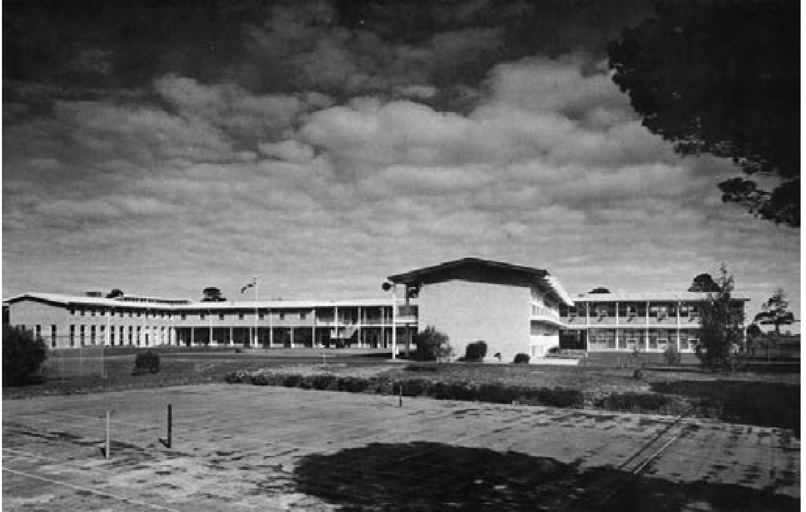
THE COMPLETED PREPARATORY SCHOOL