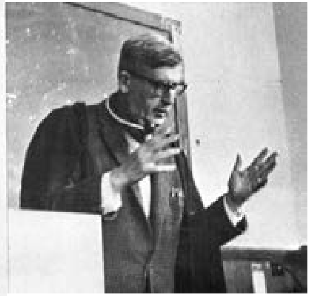
"Lands he could measure, terms and tides presage, And e'en the story ran that he could gauge."