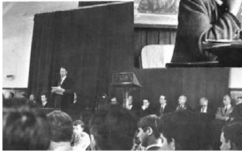
"In arguing, too, the parson owned his skill, For e'en though vanquished, he could argue still."